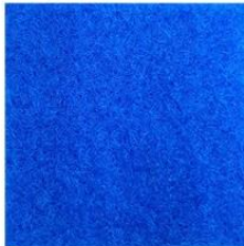
9534 Sapphire Blue