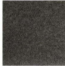
9515 Dark Grey