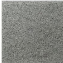
9505 Light Grey