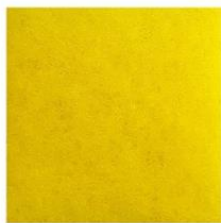
1083 Canary Yellow