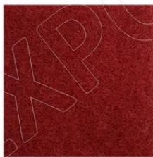
9522 Richlieu Red