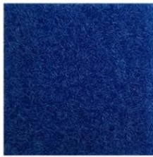
9524 Navy Blue